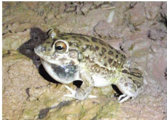
FIGURE 1. Calling male Leptodactylus bufonius in Cordillera, Santa Cruz, Bolivia.

Larvae are exotrophic, lentic, benthic guild members (Altig and McDiarmid 1999). The body is ovoid-shaped and color can vary from brown to a grayish color. Eyes are dor-